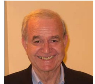
Truman Childress Scholarship Program Coordinator