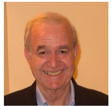
Truman Childress Scholarship Committee